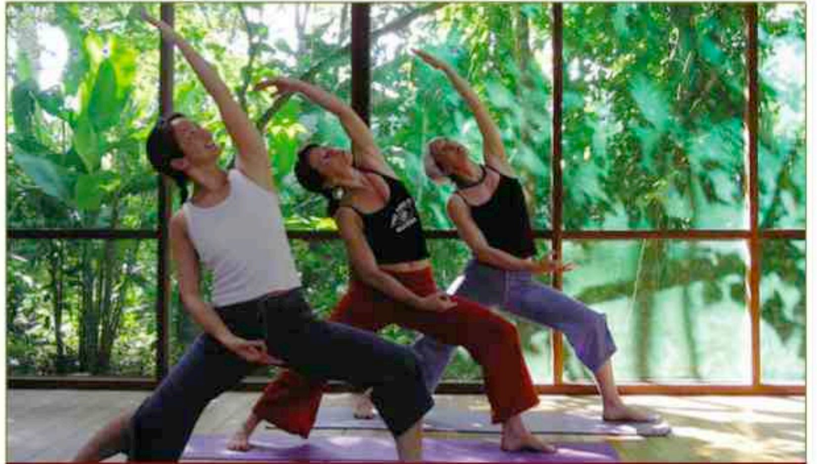
A prana vinyasa flow retreat

peace and optional activities include surfing in crystal clear waters, swimming with dolphins, sea kayaking, horseback riding and canopy tree climbing.