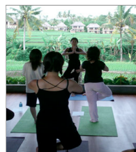
The Balispirit Yoga Barn©

While at The Yoga Barn©, the focus will be Twee's evolutionary style of Yoga. In between the Bali sunrise and sunset, you will enjoy a perfect balance of twice daily Prana Flow Yoga practice enhanced with rituals, mudra, chanting, pranayama and meditation.